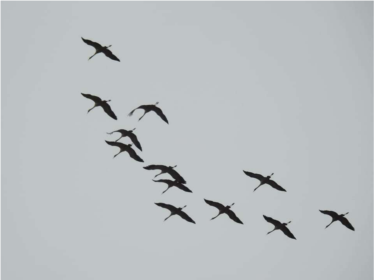
Image nº 16: Group of cranes over Punta Entinas (AL).