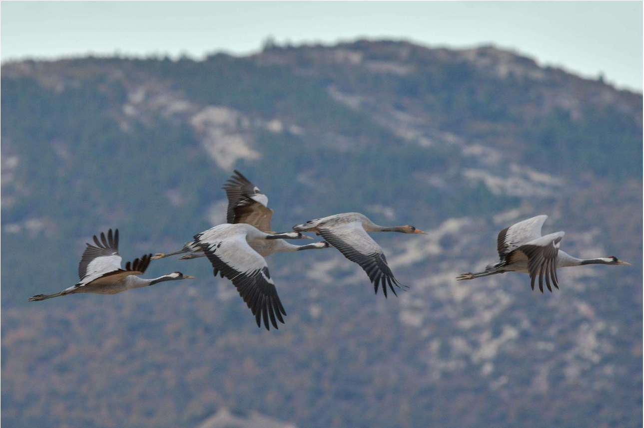
Image nº 17: Group of cranes at Gallocanta lagoon.