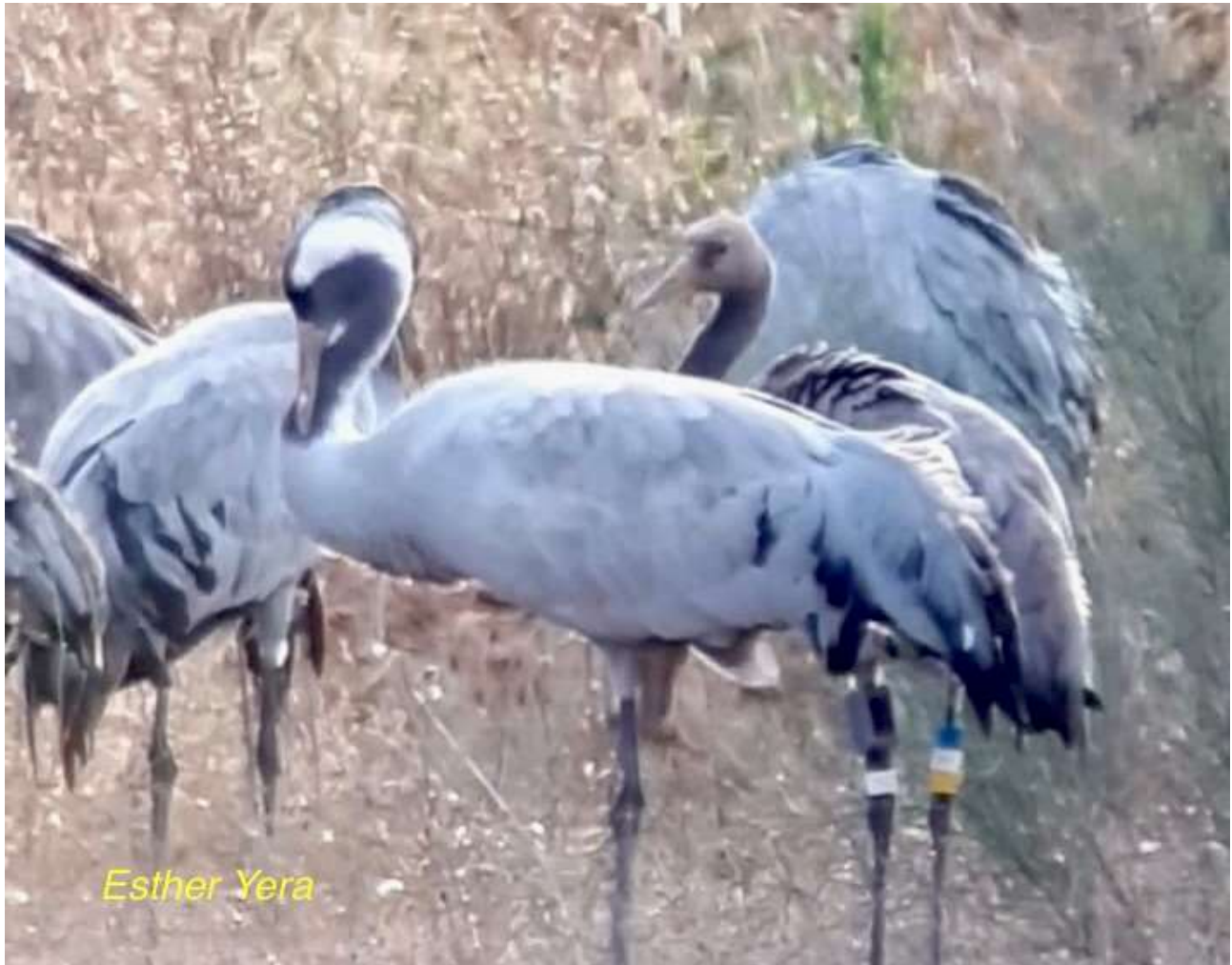
Image n° 14: Young Estonian “Mustakurmu” carrying a GPS at the small saline flats, Alcañiz (TE).